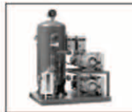
Central Source Vacuum System