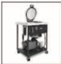
Vacuum Degassing Chambers