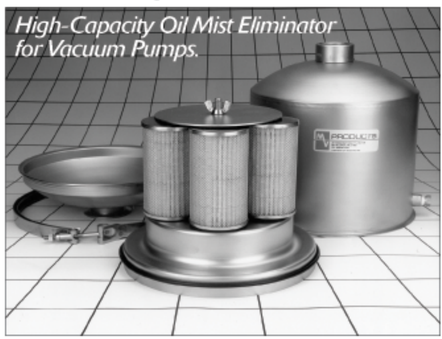
MV VISI-MIST Oil Mist Eliminator for Smaller Pumps