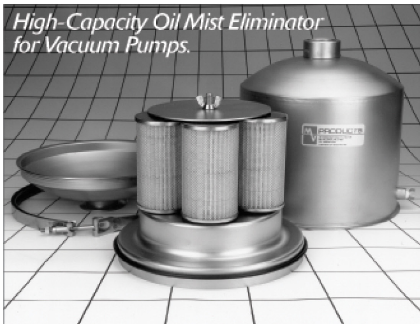
MV VISI-MIST Oil Mist Eliminator for Smaller Pumps ▶

High-Capacity Oil Mist Eliminator for Vacuum Pumps.